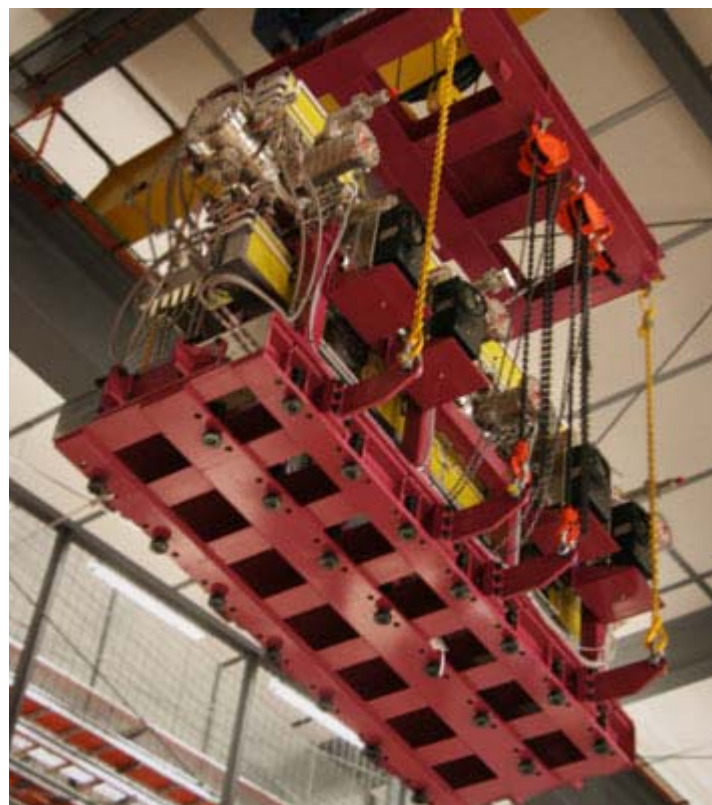
Two 3-metre in vacuum undulators weighing seven-and-a-half tons have been lifted over the storage ring tunnel for testing prior to installation.

The 2-metre in-vacuum undulator was installed inside the storage ring tunnel in October and is ready for operation.