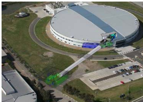
Artist's impression of the long beamline and satellite building.

The first three radiation enclosures in the Experiment Hall have been constructed. Installation of services will begin after the Christmas vacation and commissioning is expected to begin in July 2008 with low-energy micro-beam radiation therapy and fast white-beam imaging. Monochromatic capability will be added soon after. The construction contract for the civil part of the long beamline and satellite building is out for tender. Construction will begin mid-February with completion expected in mid-August. The first beam should be available before the end of 2008.