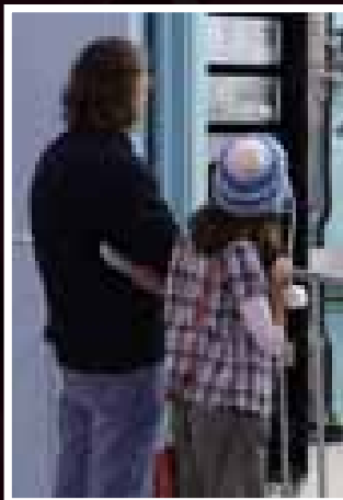
page 4: We're having an Open Day