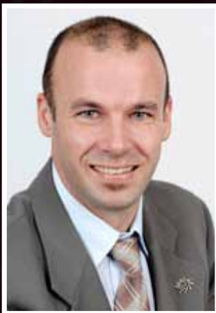
page 3: Up to speed