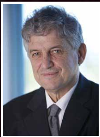
page 2: From the Acting Director